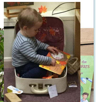
'Little Nursery' was given its